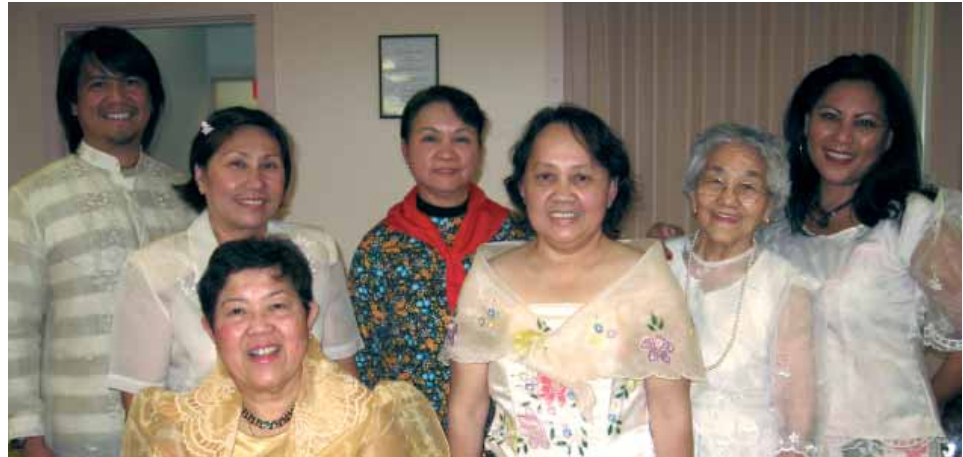
Members of the Filipino community visiting St Bernadette's.

St Bernadette's is a vibrant and caring community enriched by the cultural diversity of residents and staff. In addition to Australian-born residents, residents come from Malta, the Philippines, Poland, Germany, Italy, India, Ireland, Macedonia, Serbia and Vietnam. Many of the staff also come from non-English speaking backgrounds and are bilingual.