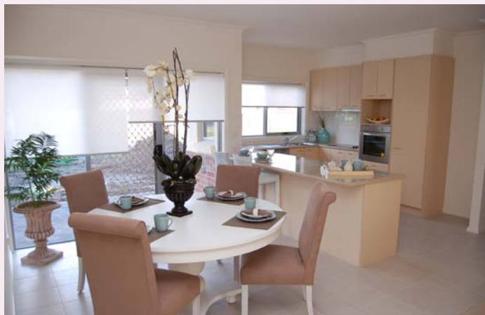
The light and spacious kitchen and dining area in the 2 bedroom Melba Display Villa is now available for viewing.