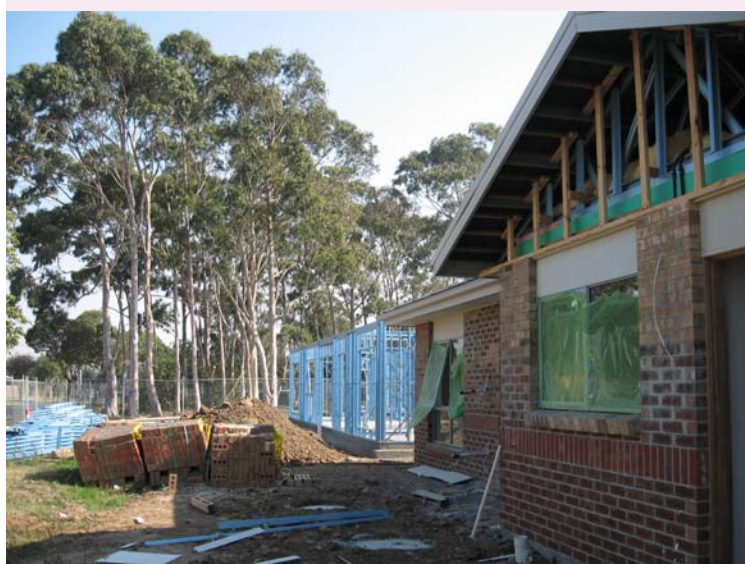
The Display Villas in Jazz Court under construction.